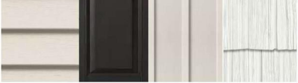
Interior Wall Color